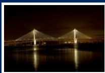
Lowcountry Regional Office 530 Johnnie Dodds Boulevard, Suite 202 Mt. Pleasant (843) 849-3887